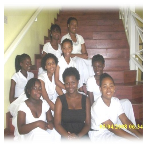
GBU members "Building Relationships"

We celebrated a week of activities in the month of October under the theme "Building Relationships" in which we learned that relationships are very fragile, hard to form, harder to maintain and very easy to destroy. During that week many activities took place including the appreciation and enrolment service, social get together, discussions on building relationships, prayer breakfast and an all-night of prayer with the 2011 BWA Day of Prayer.